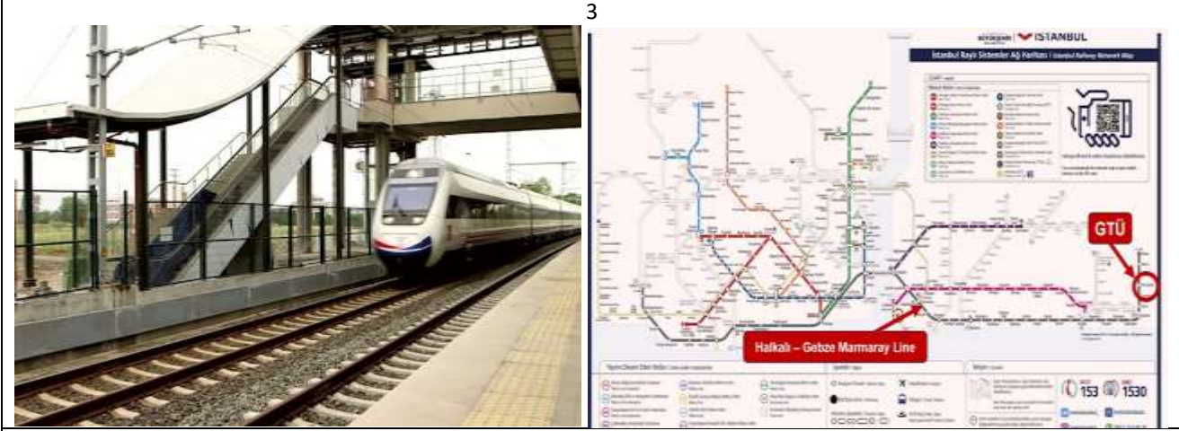
Railway station in GTU and railway maps