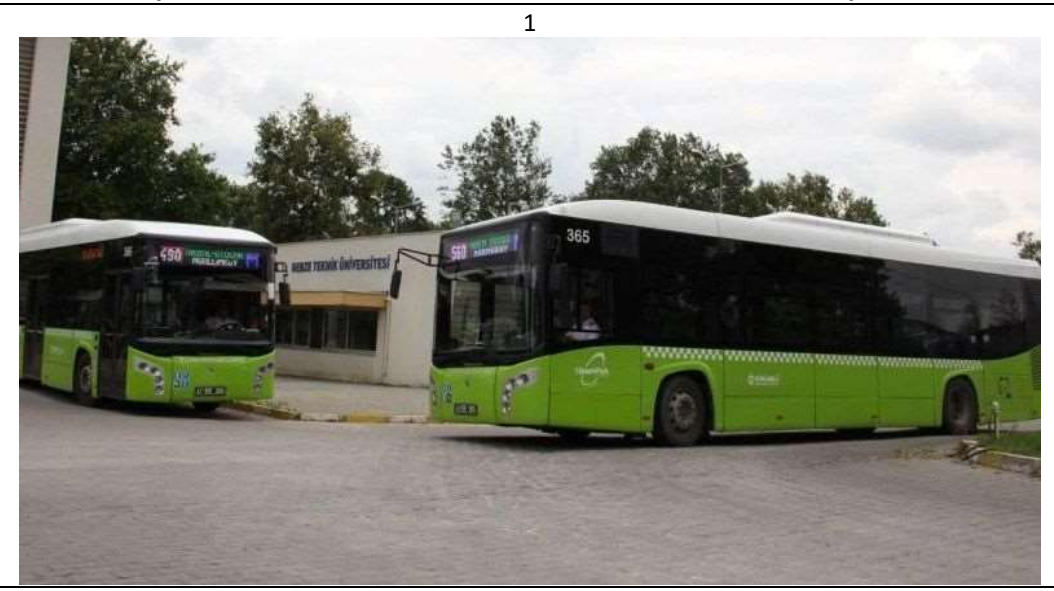
Bus from city to campus