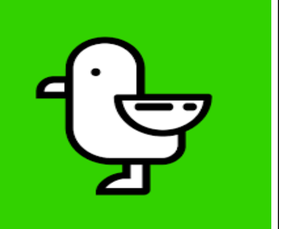
Ride Shareing (Martı Tag)

Number of Transportation Initiatives to Decrease Private Vehicles on Campus (Gebze Technical University, Turkiye)